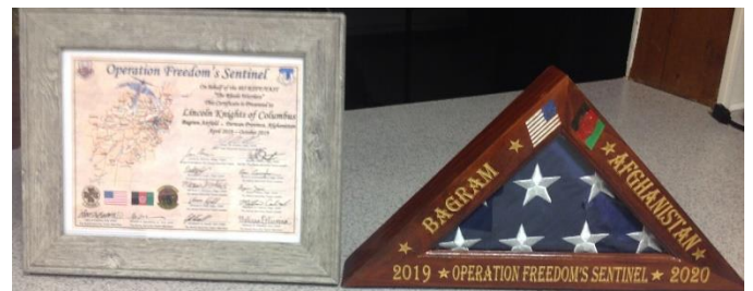
Tokens of gratitude from the soldiers, the flag flew over Bagram Air Base

The $20.00 cost to our brother knights, family and friends includes one(1) ticket, one (1) 24 oz. popcorn and one (1) 12 oz. fountain drink or one (1) 12 oz. domestic beer.