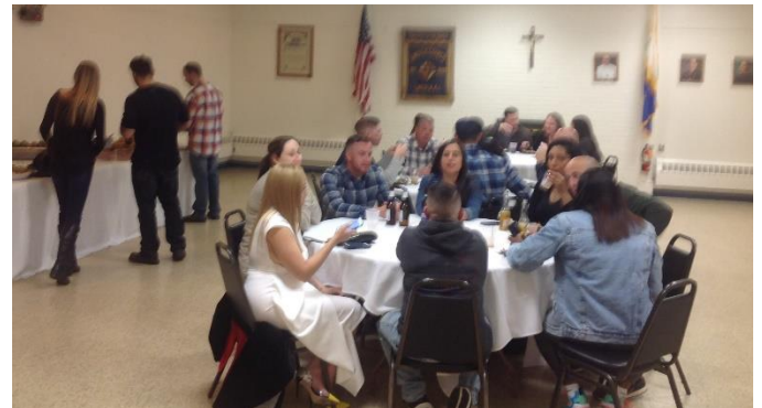
Recently returned soldiers enjoying a welcome-home dinner courtesy of Lincoln Council

The Annual RI Knights with the P-Bruins will be on Sunday, March 29, 2020 at 3:05 pm at the Dunk Center. Once again, we have lower level seats (Section 113) the goal the P-Bruins shoot at for 2 periods.