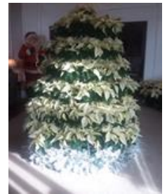
The lobby and entry décor

Welcome to a new Liturgical Year. Some years ago (long before entering the KofC) I became convinced that we need more recognition of our new year, thus the above greeting - editor