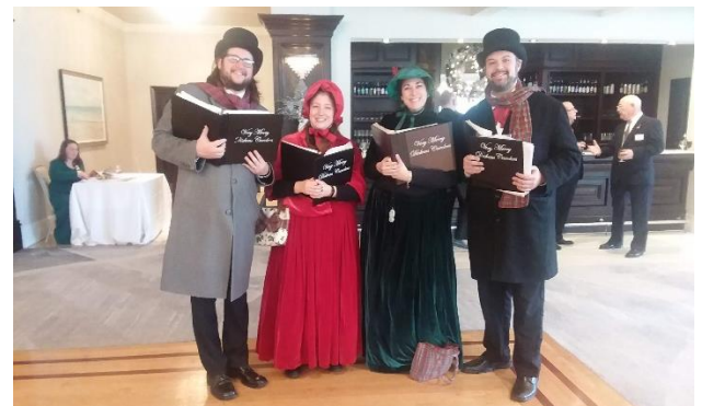
The Very Merry Dickens Carolers

Welcome to a new Liturgical Year. Some years ago (long before entering the KofC) I became convinced that we need more recognition of our new year, thus the above greeting - editor